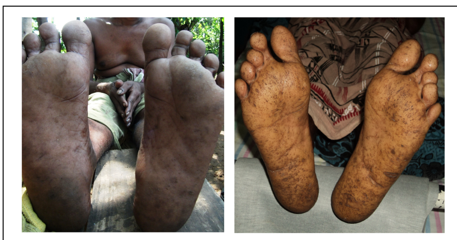
Fig 02- Abnormal skin manifestations of CKDu patients encountered in the study area

This substantiates the observations made on incidence of keratosis and hyper-pigmentation among the population in this study area. Since it is evident that with the exception of dermal manifestations, other clinical features of chronic arsenic poisoning can occur under some other medical conditions too, history of exposure to arsenic, arsenic content in hair and urine have to be considered along with clinical features to arrive at a conclusive judgment on chronic arsenic poisoning. Previous studies have shown urinary excretion of arsenic and its concentration in hair and nail are most important biomarkers of internal exposure.(Hindmash 1998). In general, blood concentrations of arsenic are too low and transient; hence it is not considered a biomarker for chronic arsenic poisoning (Muzumder 2000). Total arsenic amount in urine has been in use as an indicator of recent arsenic exposure because kidney is the main route of the excretion of many arsenic species (Buchet et al.1981). Half life of inorganic arsenic in humans is about 4 days. In European population, average urinary arsenic concentration is less than 10 µg/L (Apeal and Stoeppler 1983; Trepka et al.;1996 and Kavanagh et al.,1998). Urinary arsenic levels detected among the subjects of the present study are presented in Table 3 while table 4 shows calculation of Odds ratios.